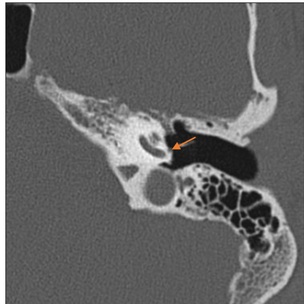
Figure 2 Axial CT scan showing the PSA on the cochlear promontory.

tympanic segment of the facial nerve is most commonly supplied by the petrosal artery, which arises from the middle meningeal artery after passing through the foramen spinosum. In this case, an alternative blood supply through a PSA was observed. The stapedial artery usually regresses by ten weeks of gestation. Persistence of the artery is a relatively rare condition, occurring in approximately 0.02–0.48% of the population [1]. The PSA branches off from the petrous internal carotid artery, runs over the cochlear promontory, passes through the obturator foramen of the stapes and finally enters the tympanic segment of the fallopian canal. The typical feature of a PSA on CT imaging is a small soft-tissue prominence along the cochlear promontory (Figure 2). This condition frequently presents with an accompanying absence of the ipsilateral foramen spinosum, which was observed in our patient.