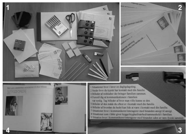
Figure 1: 1: Contents of the Cultural Probe. 2: Postcards. 3: Disposable camera with suggested ways of use. 4: Assignment in scrapbook

The purpose of this study was to understand and describe the ways that intimacy expresses itself within families and especially between children and parents. We chose cultural probes and contextual interviews in order to be unobtrusive and to reveal tacit knowledge. As suggested by Gaver, cultural probes can be used to generate inspirational responses and make the informants reflect, interpret and express upon the domain [4, 5, 11].