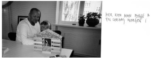
Figure 5: Examples of a play situation

Presence in absence is the sense of the other despite a physical distance [20]. We found that presence in absence for parent-child relations was related the feeling of security and trust while being physically separated. The sense of connectedness between parents and children was present in the awareness of one another. One parent expressed how he would like to be able to see his son over a webcam during parts of the day. This need for assurance of knowing where their children were was an issue of concern for the parents. Some children used technologies for presence in absence like the older child in one family used instant messaging “Sometimes I chat with my father when I come home from school” . Additionally, one father expressed how he found the use of SMS cumbersome and difficult to use. On the other hand, he stressed the idealness of SMS when communicating while hiking in areas with unstable networks. The asynchrony of messages gave the children time to formulate messages and it enabled him to read the message whenever the network allowed it “It’s like the SMS lasts longer” . One mother pointed out how the children felt like “We have got an SMS from dad!” where SMS was a one to many channel of communication between the parents and the children.