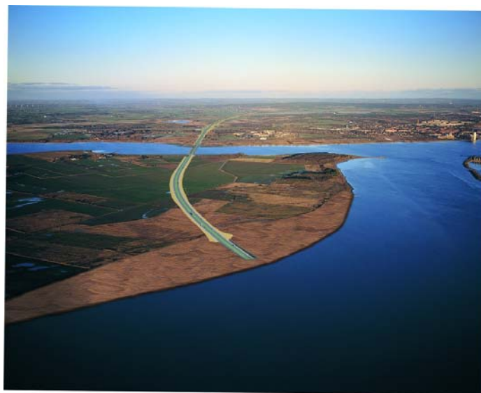
Figure 3: Snapshot from a virtual flight over one of the proposed connections.

As mentioned above the Planning Department of Northern Jutland County decided to utilise 3D geo-visualisation to support the public participation phase. All alternatives were illustrated on orthophoto in order to facilitate the communications of the various alternatives to the citizens. Furthermore the county administration has developed methodologies for 3D viewing on their web site based on Skyline Software ( www.skylinesoft.com ). After downloading a plug-in from Skyline citizens could see the various alternatives in 3D and even fly over the landscape to get a real visual impression of the effect on the landscape ( www.3d.nja.dk ). For people not familiar with flight simulator software it could be difficult to navigate over the landscape, and to circumvent this difficulty some predefined flights over the alternatives could be started by just pressing a button from a list. During the flight the user can zoom (change flight height) and get a quite good feeling of particularly the landscape effects of the various proposals.