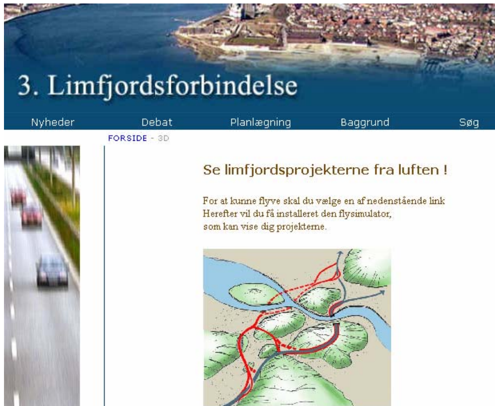
Figure 2: The project homepage with the various alternatives for the proposed connection.

Additionally, the last two alternatives were divided into sub-alternatives containing a motorway or an ordinary major road (Northern Jutland County).