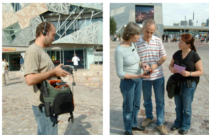
Figure 7: Studying the use of Just-for-U.s in the field: researcher operating mobile AV recording studio (left) and researcher doing contextual interview (right)