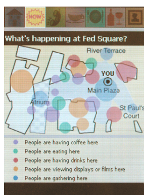
Figure 6: Now screen: showing clustering and activities of people nearby

design of the “now” screen of Just-for-U.s, augmenting the social context by displaying people and activities in proximity (Figure 6). When the user clicks on the “now” icon on the main menu, a small map of their immediate surroundings appears superimposed with dynamically updated coloured circles indicating the current clustering and activities of people within proximity. The radius of the circle indicates the number of people at a place while the colour represents their prevalent activity (e.g., “having coffee”, “having drinks”, “eating” or “attending a cultural event”) using the system’s general colour coding of these activities. The map also shows the user’s (approximate) location. Clicking on a circle takes the user to more information about that place or group of people such as menus, programmes, descriptions, images, and to wayfinding directions. The information on the “now” map is public in the sense that it is not authored or “owned” by anyone but is generated collectively by the public anonymously relaying fragments of information about themselves, their whereabouts and their history of socialising in the city in return for access to the shared resource of cumulative information.