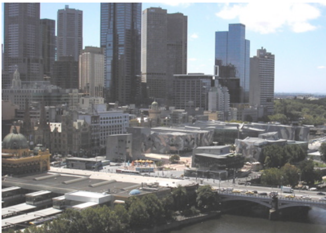
Figure 1: Federation Square, Melbourne, Australia

For the purpose of understanding urban socialising behaviour within the built environment of inner cities and informing the design of public pervasive information systems facilitating this kind of "situated sociality", the e-Spective project took its offset in a newly opened and geographically delimited civic space in the city centre of Melbourne, Australia called Federation Square (Figure 1).