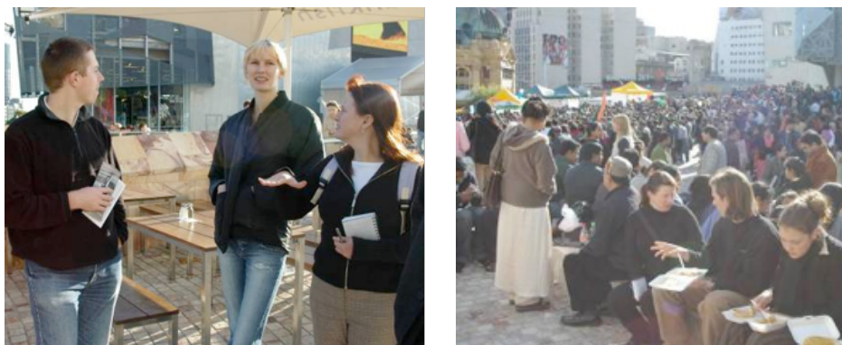
Figure 3: Contextual interviews at Federation Square

From analysing our video data it was clear to us that people’s situated social interactions in a public city space are not simple and random but highly complex. We outline here some highlights about people’s situated social interactions in the city extracted from our sociological field study.