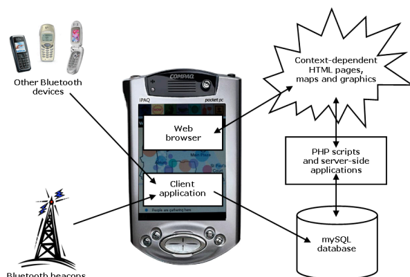
Figure 4: The general system architecture of the Just-for-Us prototype

user's list of friends. The Just-for-Us system provides the user with a range of location-based functionalities designed to facilitate social urban life. Below, we describe how it presents you with a new perspective of the city by annotating buildings and places and by showing people and activities around you.