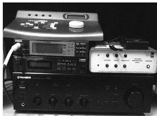
Figure 2. (left) Soundbeam control unit; (upper left) stereo sound module and stereo effect processing unit; (left middle) speaker protection unit for vibroacoustic soundbox (white) with wireless microphone upon it. All rest upon the main system stereo amplifier.