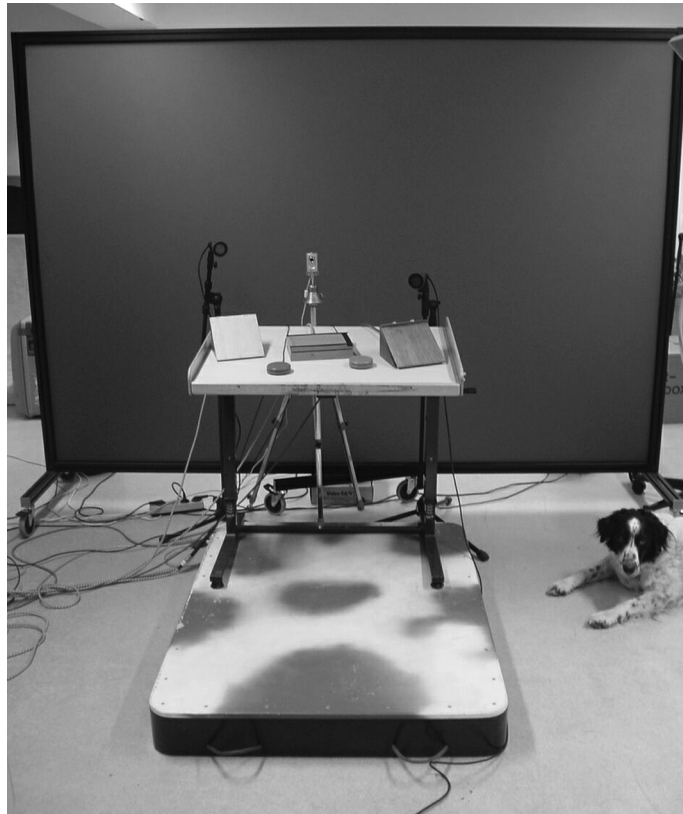
Figure 1. Two Soundbeam sensors on stands plus camera on tripod in front of the back projected Perspex screen. The table with tactile switches rests upon the vibroacoustic soundbox platform.