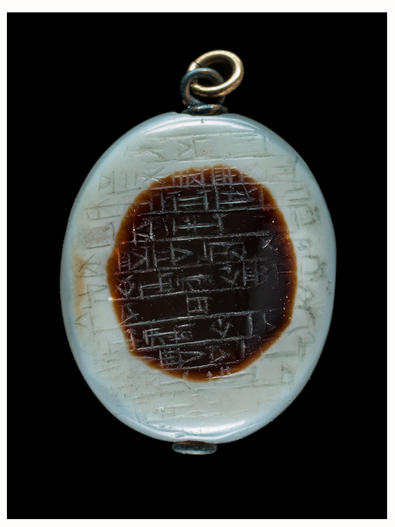
Plate 3. An "eye stone" (chalcedony) with an inscription by King Lipit-Ištar dedicating it to the goddess Ninlil ( ca 1934–1924 BC) for his long life and well-being