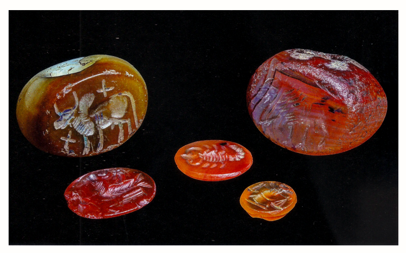
Plate 5. Three gemstones and two dome seals (carnelian, agate) with signs of the zodiac

amulet was attached to the patient's neck, the beads and bags had to be purified with holy water and placed before the goat star (Lyra), associated with the goddess Gula [Reiner 1995, 52–55]. Having received an offering, the goddess was then directly addressed in a prayer like spell recited over the beads and leather bags and was beseeched to support the patient and thwart the schemes of his enemy. In this way, the amulet ingredients were activated with divine agency and power and then attached to the body, providing a kind of protective shield.