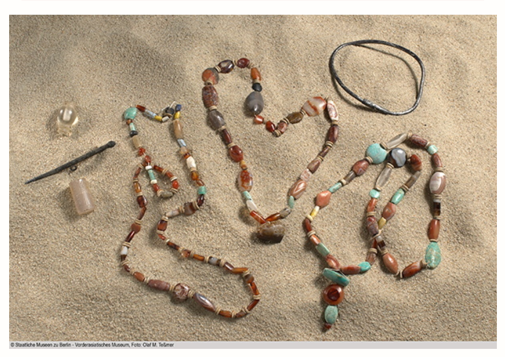
Plate 1. Pieces of jewelry found in a grave at Babylon, Merkes ( ca 13th/12th century BC)

Clothing pin (silver), a large bead (rock crystal), cylinder seal (rock crystal), three necklaces of precious stones and gold, and a silver bracelet. VA Bab. 1377 01–07.