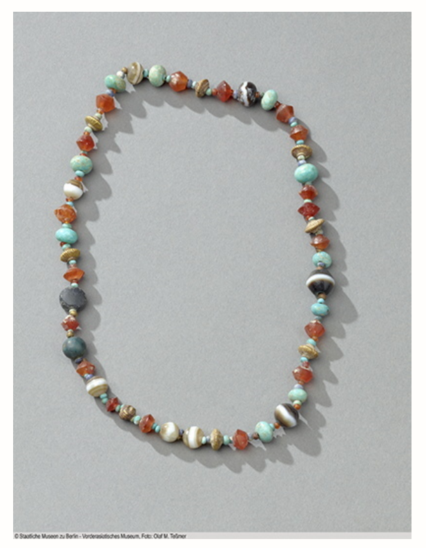
Plate 2. A necklace with semiprecious stones and gold beads found in a grave at Babylon, Merkes (first half of the first millennium BC)

VA Bab. 2550.001.