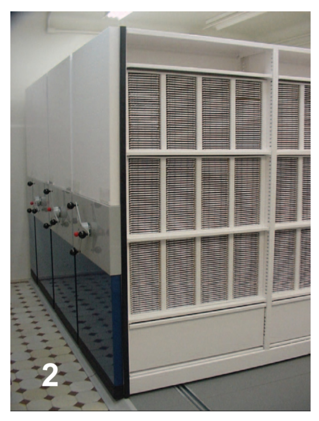
Figure 2. Steel door-sliding cabinets in where the samples of the Helminthological Collection of the Oswaldo Cruz Institute are maintained (After Noronha et al. , 2009).

Fortunately, there are still expanding scientific staffs working in the neotropical region and with a great interest in helminthological investigations of taxonomic and systematic applicability, in order to minimize possible harmful effects on research protocols established in the developing countries as Argentina, Brazil, Colombia, Costa Rica, Cuba, Mexico and Peru, aiming for their worldwide recognition (Lamothe-Argumedo et al. , 2010).