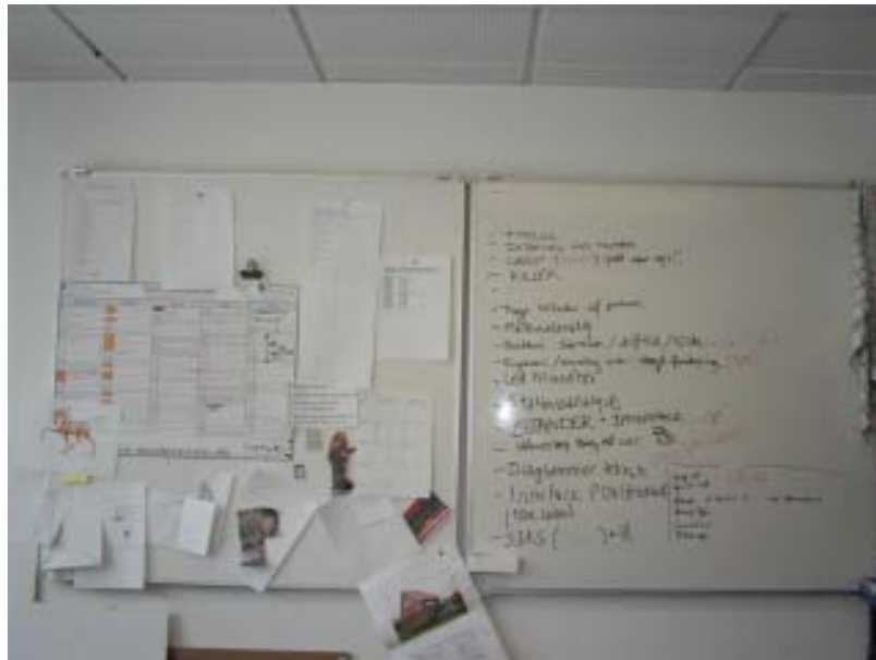
Picture 1 project management

To make a project efficiently, students experience that the best group size is 5 to 6 persons who divide the work into different tasks. Therefore, doing group work in groups incorporated doing individual work, working in sub-groups and working in the project group. Many groups put both long-term (normally a semester, for the whole project) and short-term plans (either one week or two weeks) on the wall in their group room. For the long term plan, they signify some milestones in a semester calendar, which might be kept flexible for modification along the way. For the short term plan, some groups draw time tables on a blackboard (it is normally the task of the group leader), and in the group meeting they fill in things that need to be done before they discuss who will do them. Some groups make a list of tasks in the group meeting and then discuss who would like to do what and how long it will take (see picture 1).