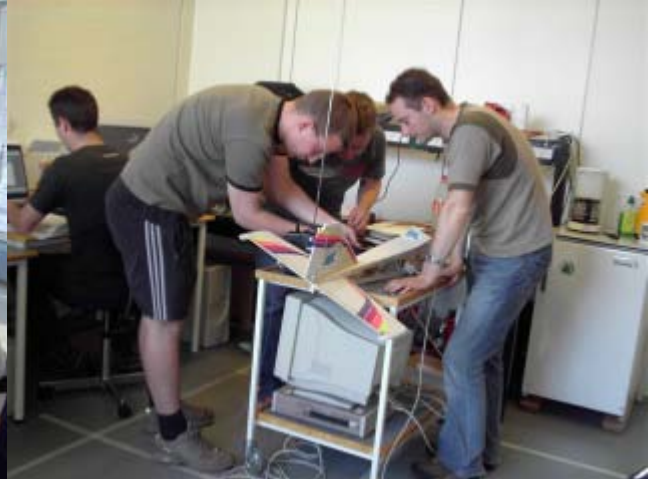
Picture 3 communication in the team work

Studying engineering in the PBL environment, at first, students as newcomers need supports for all phases of doing project in groups, especially how to formulate and analyze research questions and how to manage the project process. Gradually, they begin to take on responsibilities for the project work, like taking turns to be group leaders, participation into dividing and fulfilling different parts of work. The collaboration in the group work also helps to promote the sense of responsibilities, to develop the readiness for commitment to the communities' practice and to make different contributions to ongoing activities as they transform their participations.