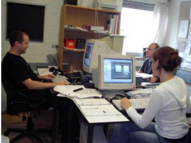
Picture 2 collaboration in the team work