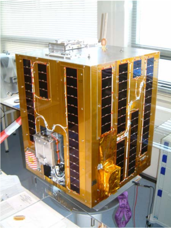
Figure 2. The SSETI-Express flight mode