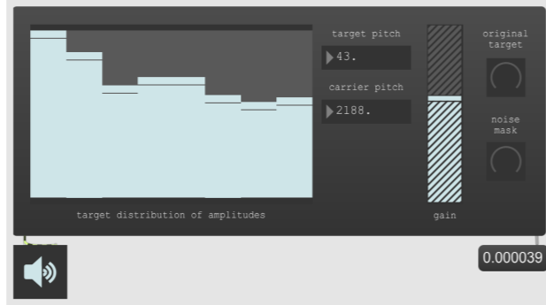
Figure 3. Example patch considering n = 8 loaded with the bpatcher object. In this example the patch is used to synthesize an Auditory Distortion Product with a frequency of 43Hz and a particular distribution of harmonics through a carrier complex of pure tones with frequencies 2188Hz, 2231Hz, 2274Hz, ..., 2489Hz and having an \ell^2 -error of 0.000039.

Since most experiments were conducted using n = 8, 12 and 16 , we also made three patches with a fixed amount of harmonics in the target distribution of amplitudes corresponding to these numbers. Such patches were made in a way that when loaded using the bpatcher object in Max, a simple but functional GUI is shown (see figure 3) whose main purpose is to make the usage of the external as simple as possible.