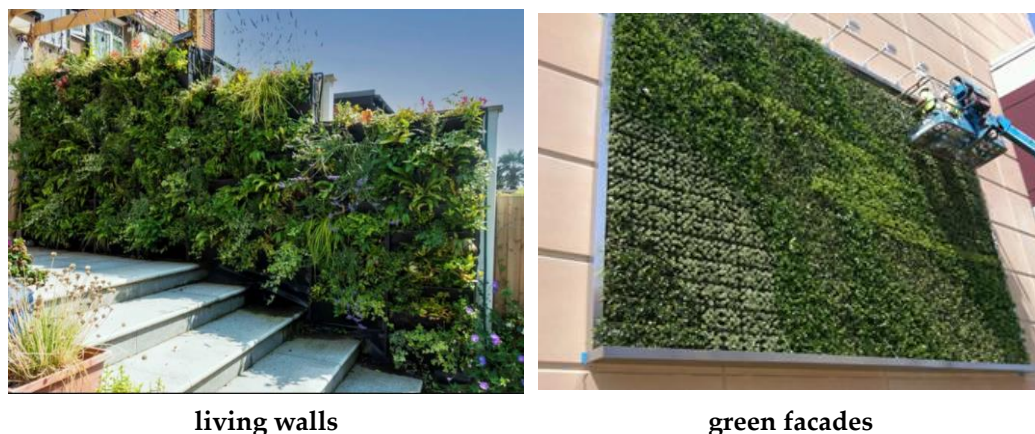
Figure 1. Systems of living walls and green facades.