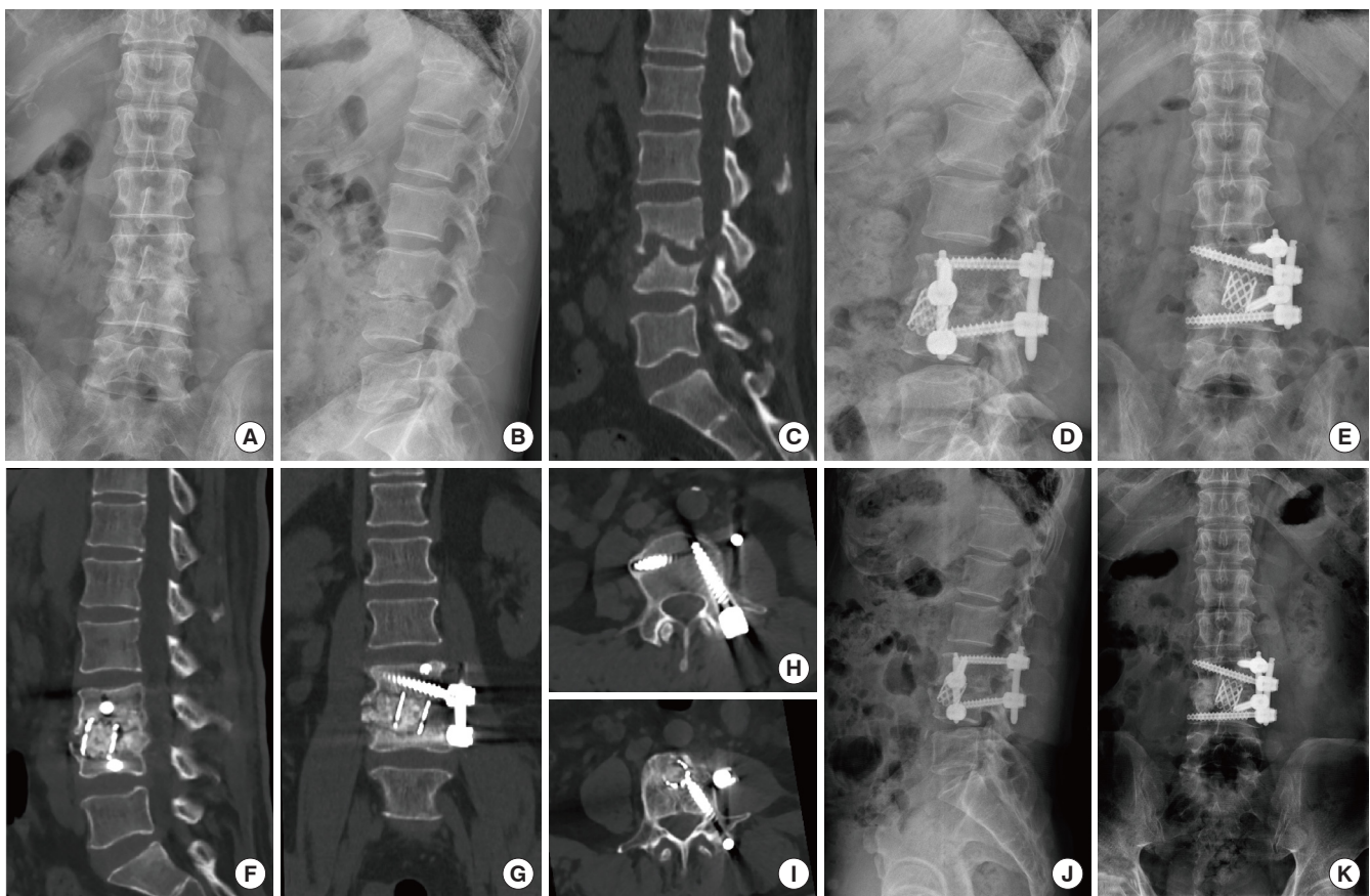
Fig. 3. Perioperative images of a representative case diagnosed as L3/4 tuberculosis in single-position oblique lateral interbody fusion group adopting titanium mesh as implant. (A, B) Preoperative x-ray in coronal and lateral view. (C) Preoperative computed tomography (CT) scan in lateral view. (D, E) The postoperative x-ray in lateral and coronal view. (F–I) The postoperative CT scan in lateral, coronal and transverse view. (J, K) The 1-year postoperative x-ray in lateral and coronal view.

SP-OLIF, single-position oblique lateral interbody fusion.