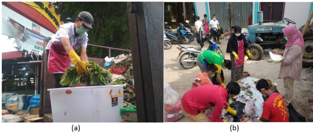
Figure 2. (a) Collecting the sample (b) Waste sorting

The average of TMSW composition for eight consecutive days sampling in the morning and afternoon can be shown in Table 2 and subsequently :