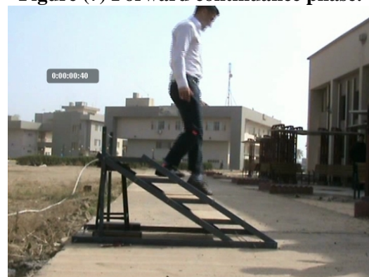
Figure (8) Controlled lowering phase.