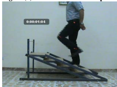
Figure (4) Foot clearance phase.