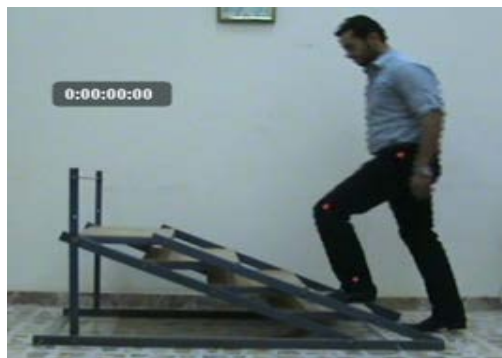
Figure (1) Weight acceptance phase.