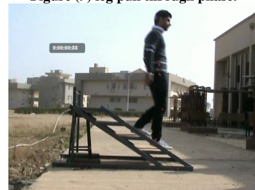
Figure (10) foot placement phase.