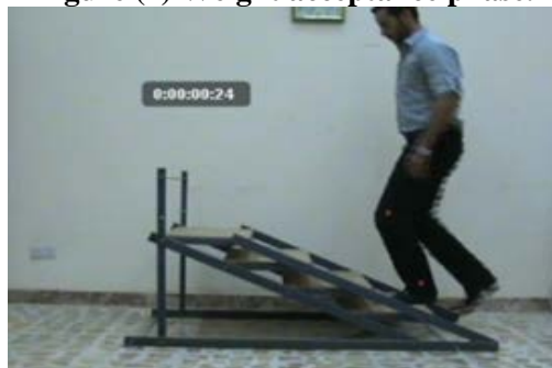
Figure (2) Pull-up phase.