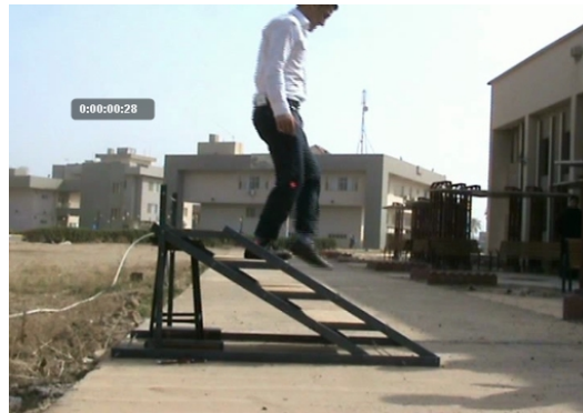
Figure (7) Forward continuance phase.