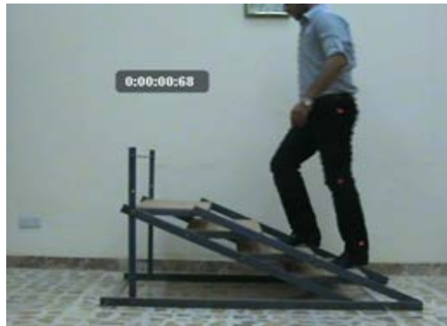
Figure (3) Forward continuance phase.