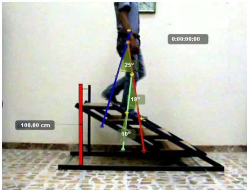
Figure (12) the experimental set-up and the angles arrangement a video camera recorded the spatial positions of Circular passive markers.