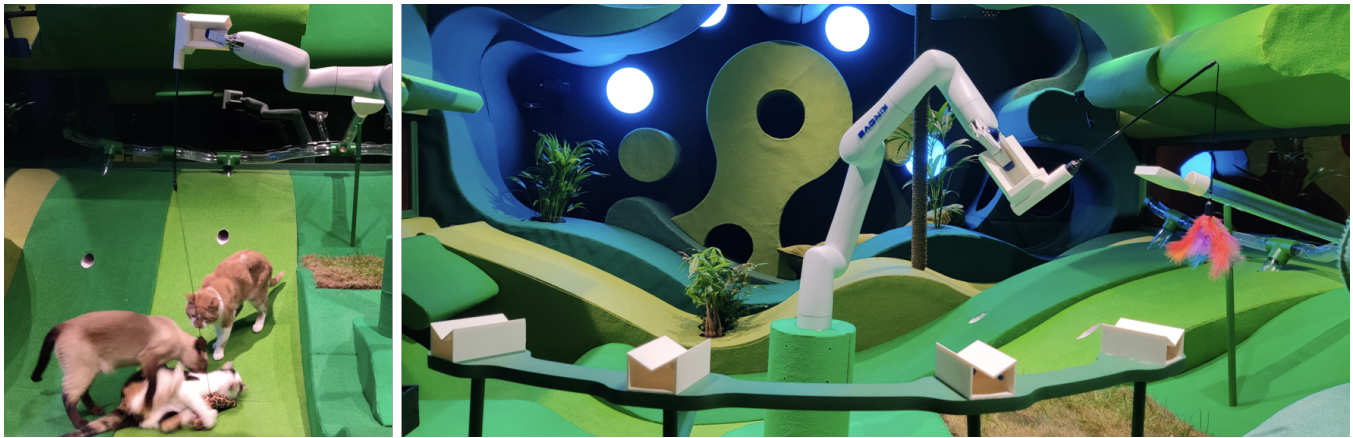
Figure 1: The the three cats (Clover, Pumpkin, and Ghostbuster) playing with a toy (left) and the robot arm lifting the feather helicopter toy from the rack (right)

the artists fielding many questions, but nothing to suggest an outcry or backlash against the project.