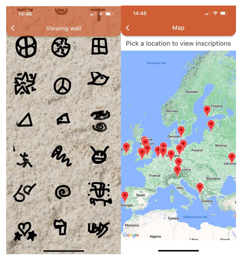
Figure 2. Screenshots of the MEMO Project Inscription app's viewing wall containing all submitted inscriptions (left) and a map where the inscriptions were created.

The app's community-driven approach facilitates collaboration and idea exchange amongst users. Rather than functioning solely as a one-way communication tool that displays information, it fosters a sense of collaboration and shared responsibility. By allowing all submitted inscriptions to be viewed, the app promotes a sense of community and shared purpose among users. It also provides a platform for individuals to share their thoughts and feelings about the mass extinction event, creating a space for dialogue (Figure 3). The app was presented at the UN Convention on Biological Diversity Conference of Parties (COP 15) in December 2022 to raise global awareness of the Eden Portland project. Here, approximately 100 people engaged with the app.