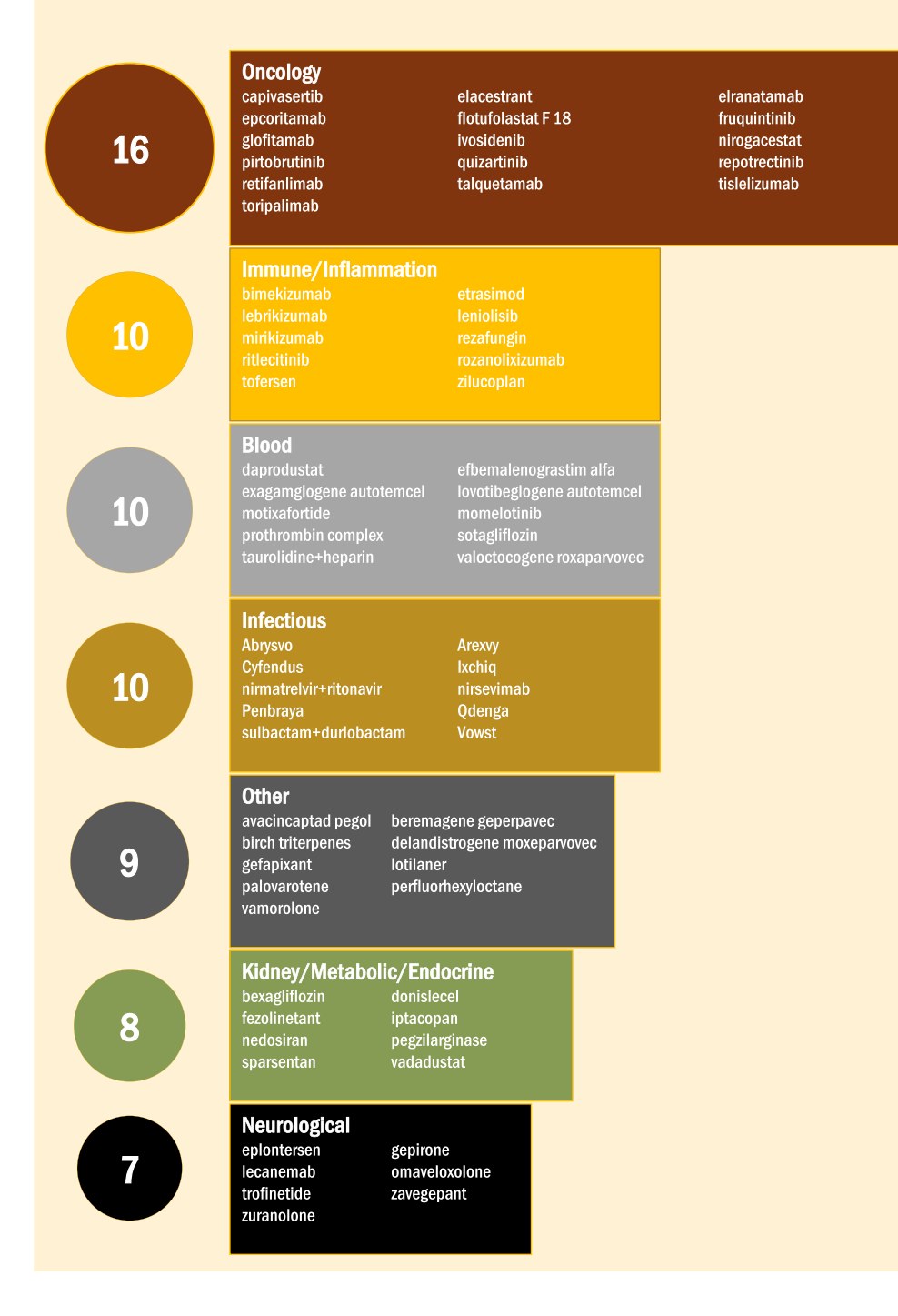
FIGURE 2 New drugs approved in 2023 by the European Medicines Agency (EMA), Food and Drug Administration (FDA) and Medicines and Healthcare Products Regulatory Agency (MHRA), by therapeutic area/ category.

reduced the risk of developing RSV-associated LRTD by 82.6% in people 60 years old and older, regardless of RSV subtype or the presence of underlying coexisting conditions. For both vaccines, safety and serious adverse effect profiles were not statistically different than those of placebo.