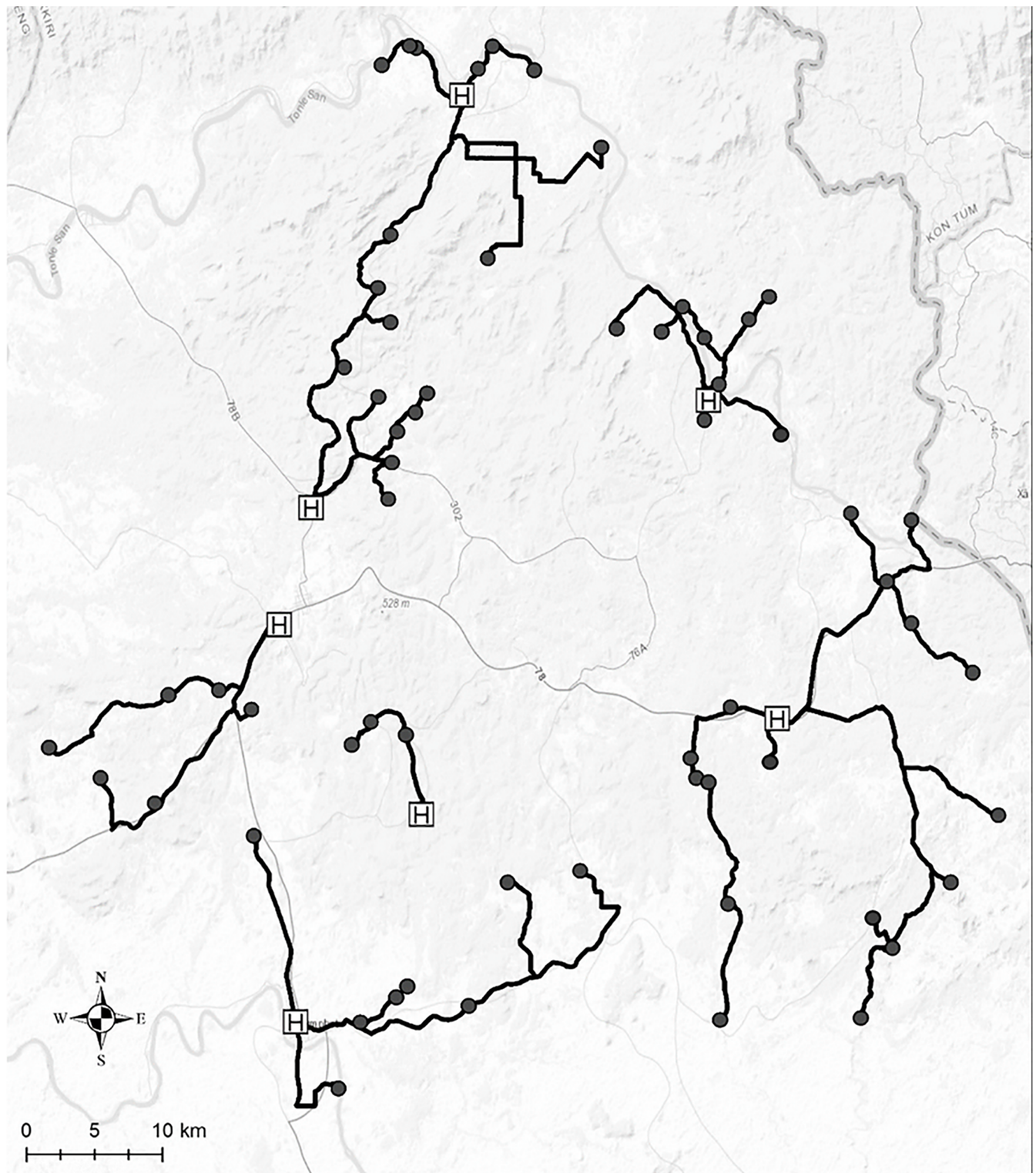
Fig 2. Map of study site in Ratanakiri province with actual travel route from 62 villages to their nearest health centers. Black circle: village, black line: actual travel route from each village to its nearest health center, H: health center.

https://doi.org/10.1371/journal.pone.0194103.g002