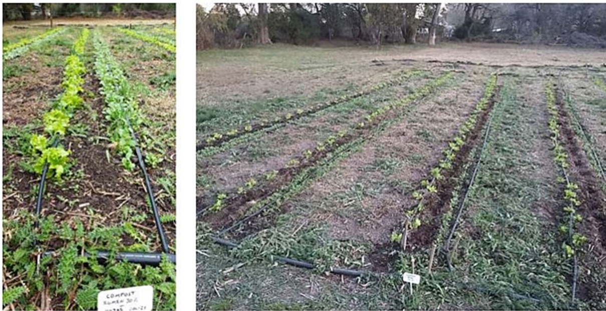
FIGURE 5 Details of the placement in the soil of the lettuce and radish at periurban farm TTV and of the irrigation system.

production, but no chemicals were being used prior to the study. In both locations and for all growing cycles, the radish crop was begun by planting controlled seeds and the lettuce crop was started by transplanting seedlings (procured from a conventional non-agroecological supplier, as producers usually do) to the chosen location. The idea was to reproduce the situation that it is most common in the use of seeds and transplanting seedlings.