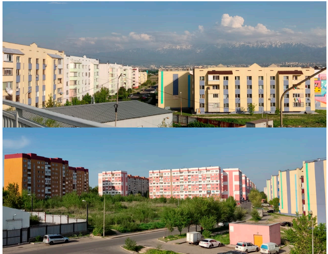
Figure 2. Views of the surveyed social housing complex, Almaty, Kazakhstan.

Participants aged 18 years or older were considered eligible to participate in this study. To ensure the survey reached a representative cross-section of the Zerdely population, a total of fifteen trained interviewers from the Department of Pharmaceutical Technology of Asfendiyarov Kazakh National Medical University were used. These interviewers administered the face-to-face questionnaire survey in the respondents' approved language version, using Kazakh or Russian language formats, prior to obtaining the signature on the participant consent form to ensure inclusivity and comprehensiveness in data collection. An introductory script was used to introduce the survey to each resident. The survey interviewers went door-to-door in pairs and administered the survey using a paper questionnaire distributed throughout the neighbourhood to cover apartments with different plan layouts, exteriors and floor heights.