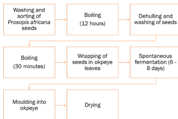
Fig. 1. Local production technology for the fermentation of Prosopis africana seeds into okpeye .

Tenfold dilutions were prepared in Maximum Recovery Diluent (MRD; Oxoid, UK). Appropriate dilutions were plated out in duplicate on Plate count agar (PCA; Oxoid) incubated at 27 °C for 24 h to enumerate the population of aerobic mesophiles, Mannitol salt phenol-red agar (MSA; Millipore, UK) incubated at 37 °C for 24–48 h for the enumeration of Staphylococcus and MacConkey agar (MAC; Oxoid) plates incubated at 37 °C for 24–48 h to enumerate Enterobacteriaceae .