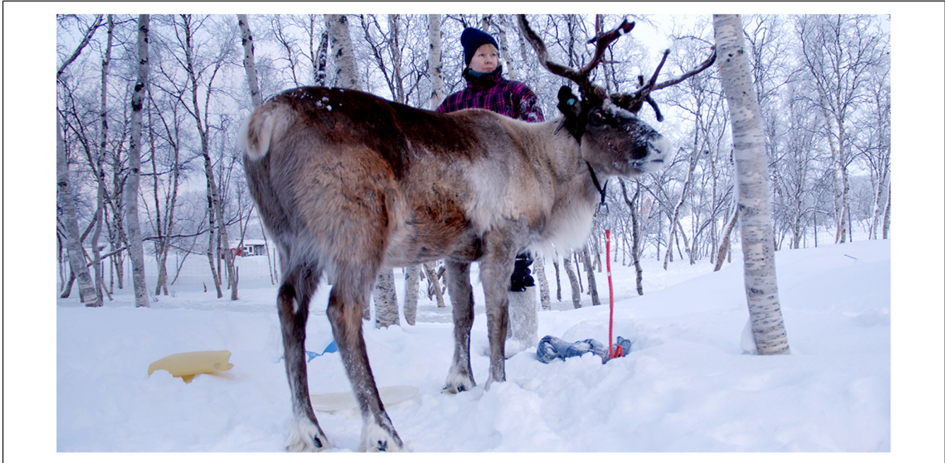
Figure 3. City reindeer(Koski, 2022). Picnic with a reindeer.

various forms of othering, speciesism, human exceptionalism and a disregard for species interconnectedness. Even though we often forget that humans are members of the animal kingdom, too, we have a fundamental need to be in communion with other animals (Andersson, 2023). In response, my multispecies picnics set out to subvert the perceived distance between the human and more-than-human by inquiring into my animal senses to explore, in David Abram's (2010) words, "the elemental kinship between the body and the breathing Earth." The paradigm of performance art is considered particularly appropriate here in that it provides a tradition of and means to "appear together" in the same image space or stage with the more-than-human (Arlander, 2022: 153). Scholarly research often takes a critical stance, creating a sense of outsidership and limitations in developing a lived experience of interdependency, agency, and compassion. Drawing from Derrida (2008), my serial picnics with animals inquire into what happens when first absence and then the silence of the non-human is "imposed" on humans.