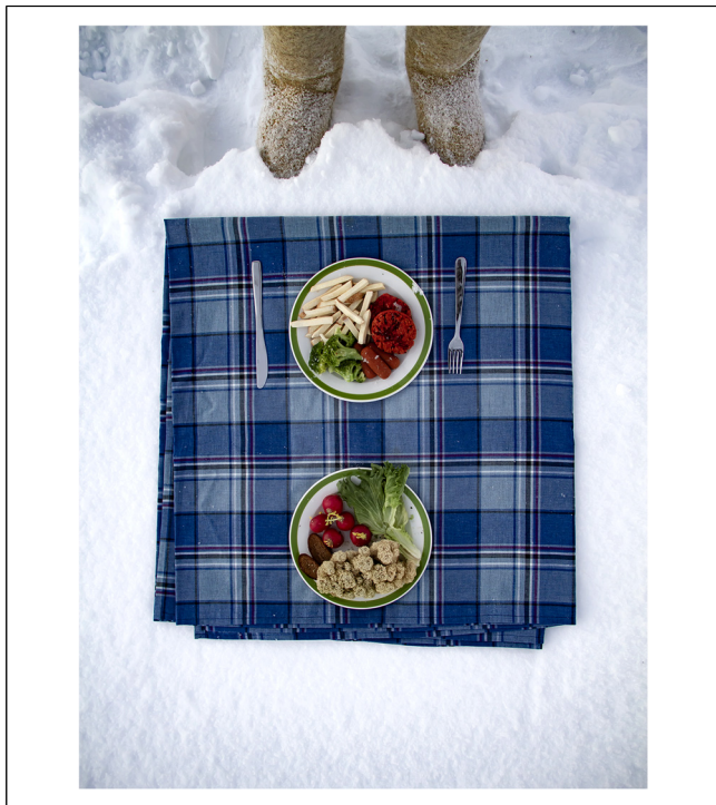
Figure 1. City reindeer (Koski, 2022). Frozen multispecies picnic.

It is -30^{\circ}\text{C} , -22^{\circ}\text{F} , and early January in sub-arctic Finland. The sun is not rising yet above the horizon. The landscape resembles a pastel-colored hyper-reality or a film