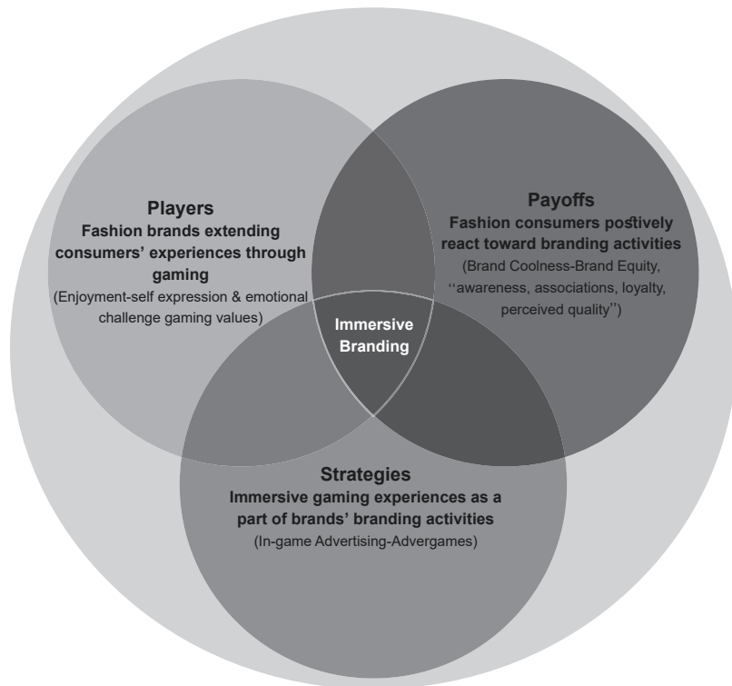
Figure 1. Game theory framework