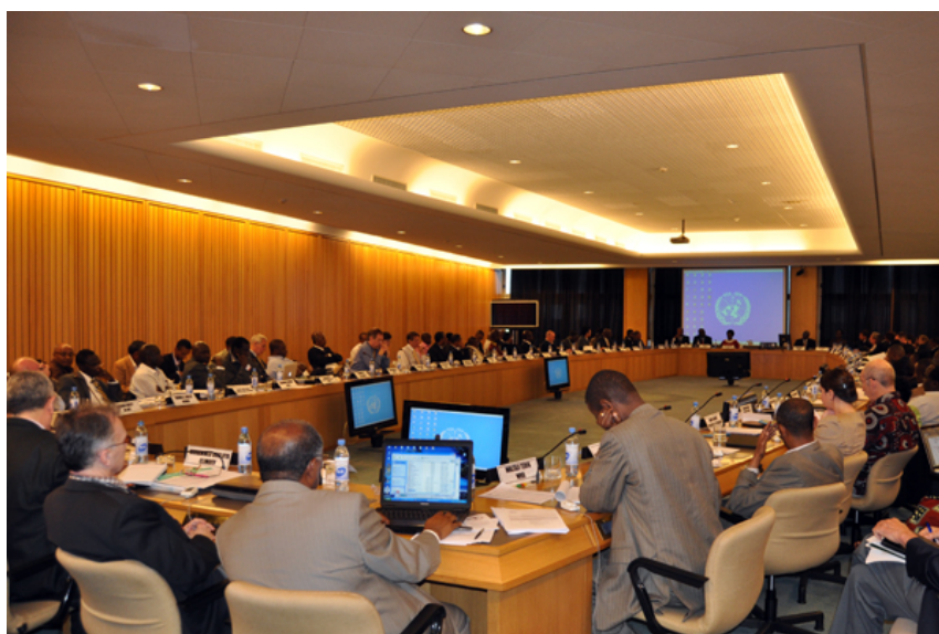
Participants at the opening session of the 'Climate and Health in Africa -10 Years On' in Addis Ababa, Ethiopia, April 4-7, 2011; Photo credit Dayan Berhe