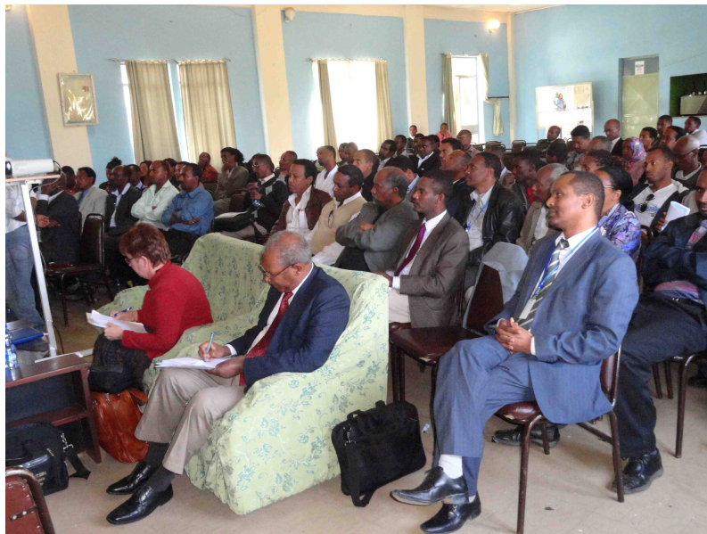
Participants at the launch of ENACT and other NMA products in Addis Ababa, Ethiopia, December 20, 2011; photo credit: Tufa Dinku

These ENACT product overcomes widely recognized barriers: 1) climate data quantity, quality and dissemination; 2) creation of appropriate and accessible climate services; 3) uptake and use of climate information by development decision-makers; 4) appropriate policy changes that enable better climate risk management (IRI Gap analysis). Thus, the above outcomes have significantly improved the availability, access and use of climate information in Ethiopia.