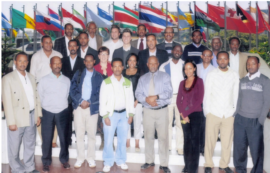
Participants of the workshop on “The use of Climate Information in Impact Assessment for Malaria Interventions” held in Addis Ababa, Ethiopia December, 2011

A total of 28 participants took part in the workshop. They came from a wide range of backgrounds: health practitioners from federal and regional health bureaus, researchers from universities, development organizations, donors, and the NMA of Ethiopia.