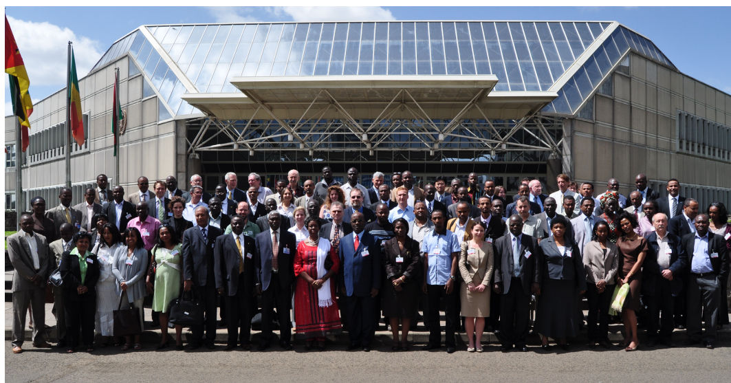
‘Climate and Health in Africa –10 Years On’ workshop participants in front of the UNECA Conference Center, Addis Ababa, Ethiopia, April 4-7, 2011; Photo credit Dayan Berhe