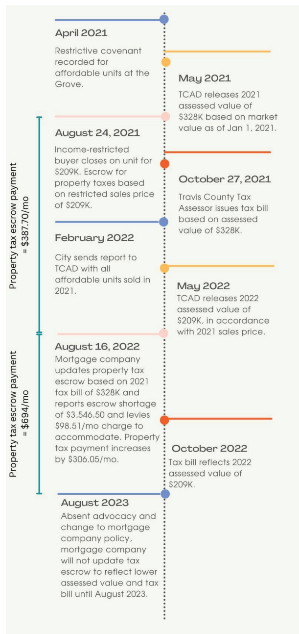
Figure 1: Initial Property Tax Impacts on Affordable Condominium Units at the Grove

in August with a restricted sales price of $209,000. Because the sales price restriction was not recorded before January 1st, TCAD assessed the unit based on its market value on January 1st of $328,000, rather than the $209,000 sales price restriction. This higher assessed value resulted in a property tax bill on the unit for 2021 of $7,146, which was approximately $3,500 higher than the property tax bill would have been if the sales price restriction had been recorded before January 1st.