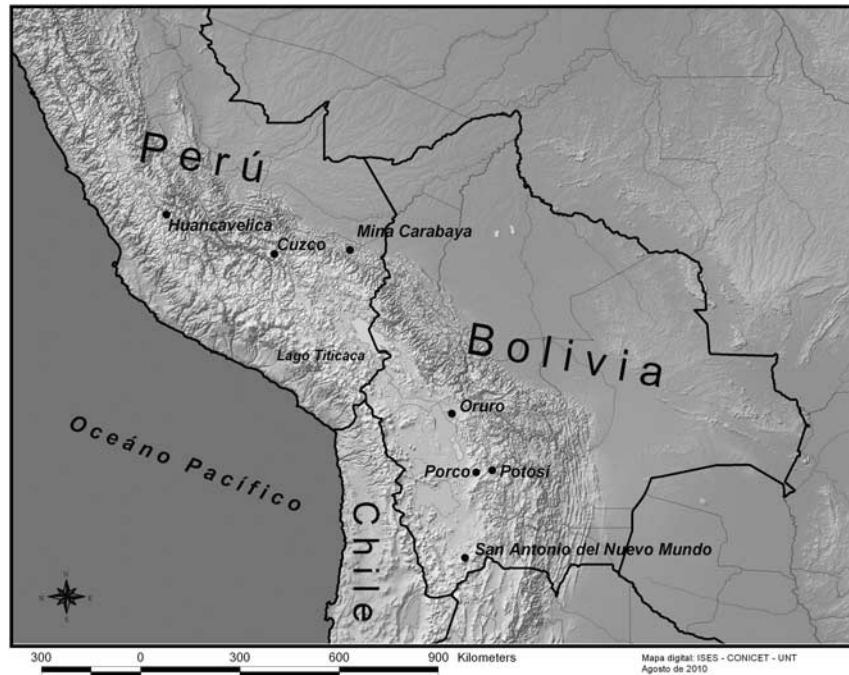
Figure 1. Andes cities and mines during the seventeenth century. Natural Earth ( www.naturalearthdata.com ), August 2010

centres by labourers from all corners of the Peruvian viceroyalty. The labouring population needed to be fed and kept supplied, and the people who brought the provisions – often from very distant places – also added to the population. In his Natural and Moral History of the Indies , Father Acosta noted: