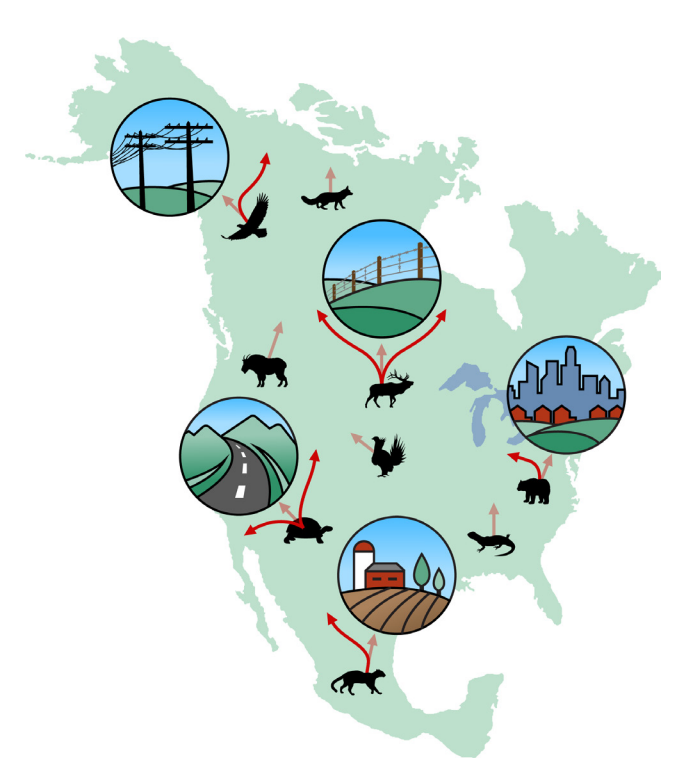
Fig. 1. Species will need to shift their geographic ranges in response to rapidly changing climates (transparent red arrows). However, anthropogenic landscape features—such as cities, farms, roads, fences, and power lines—can act as filters or barriers necessitating alternate paths (solid red arrows). These features and other impacts can lead to geographic range contraction (e.g., imposed on taxa with only transparent arrows). Figure by Duncan MacGruer.

landscape resilience that will sustain biodiversity and ecological function into the future. They consider how habitat configurations promote the regional movement of plants, animals, and whole ecosystems. Conserving these areas will ensure that our dynamically changing planet harbors the climate refugia of the future.