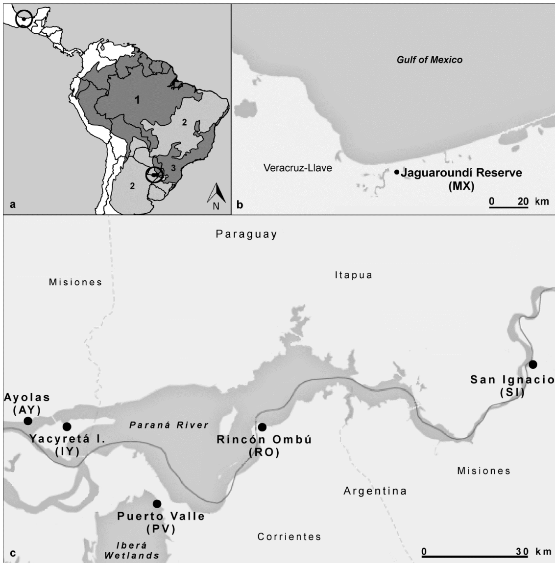
Figure 1. Location of the five studied populations within the biogeographic regions (modified from Morrone, 2001). a. Biogeographic Subregions cited along the text: 1. Amazonic Subregion. 2. Chaqueña Subregion. 3. Paranaense Forest Subregion. Circles: Sampled populations (POP). b. Mexican C. brasiliense POP. c. Argentinean and Paraguayan C. brasiliense POP.

incorporation of 2% polyvinylpyrrolidone (PVP), 5 mM ascorbic acid, 4 mM sodium diethyldithiocarbamatetrihydrate (DIECA) and 1.2% β-mercaptoethanol into the digestion buffer in a 2 ml plastic tube to improve the homogenization at 37°C for 3 h [26]. After chloroform: isoamyl alcohol (24:1) organic extractions, the DNA was precipitated with 2/3 isopropanol at -20°C for 1 h. The DNA isolation was verified and semi-quantified electrophoretically in 1% agarose gels, stained with 0.5µg/ml ethidium bromide against a mass ladder (BioRad), yielding 10 - 50 ng/µl.