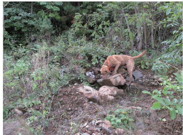
Figure 2 Photo of the detection dog used in both field surveys. The use of an olfactory versus visual search image allows for the dog to effectively search large areas and locate samples independent of condition or visibility.

An adult male rescued Chesapeake Bay Retriever was used in both surveys (Fig. 2). Adopted at approximately 2 years of age, he was selected due to his strong ball drive and high energy level, 2 key factors that make a successful conservation detection dog (Smith et al. 2003). Prior to the start of the first survey in 2009, 3 weeks were spent in Misiones acclimatizing the dog to the area and working on basic training. The dog was trained using scat samples from both captive and wild animals, for which species identification had been genetically confirmed. DeMatteo et al. (2009) demonstrated that using scats from captive animals in training did not impede the dog's ability to recognize target species in the field. The dog was trained to indicate on 4 target species (jaguar, puma, ocelot and bush dog) and to ignore several nontarget species (maned wolf [ Chrysocyon brachyurus Illiger, 1815], margay [ Leopardus wiedii Schinz, 1821], jaguarundi [ Herpailurus yagouaroundi