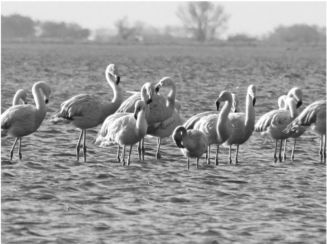
FIG. 3. Two subadult James's Flamingos preening among Chilean Flamingos in Laguna Melincué.

wetland types during the breeding and non-breeding season. Mar Chiquita, an important site used by James's Flamingos in winter, is located 350 km north of Laguna Melincué (Caziani et al. 2007). Third, our record shows the importance of carrying out more extensive and prolonged surveys at these lowland wetlands. We observed James's Flamingos at Laguna Melincué during focused behavioral studies of Andean and Chilean flamingos lasting several weeks versus during snapshot surveys. It is possible James's Flamingos had been using Laguna Melincué prior to our observations but were not detected because they were in large groups of other flamingo species or were in areas of the wetland that were not surveyed on prescribed routes. We recommend studying individual James's Flamingo movements using satellite telemetry to identify important sites for this species, because wintering sites remain unknown. Similar studies on Andean Flamingos provided novel information on movement patterns and habitat use that are crucial for developing