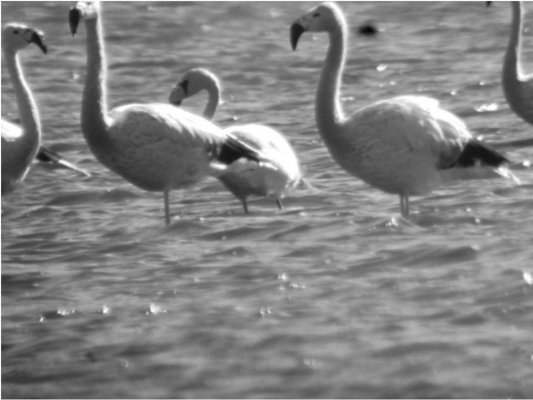
FIG. 2. Adult James's Flamingo walking among Andean Flamingos in Laguna Melincué.

site. Most of the time we observed them close to each other, within a group of Chilean Flamingos that varied from 800–1,300 individuals, while only occasionally they mixed with a smaller group of Andean Flamingos that varied from 50–275 individuals. During our opportunistic observations, James's Flamingos spent most of the time preening, walking, or feeding.