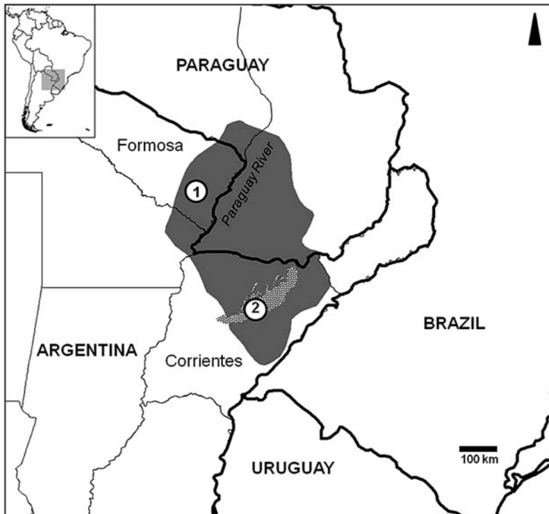
Figure 1. Map showing the present distribution of the Strange-tailed Tyrant (grey area) from Di Giacomo et al. (2011a). Numbers indicate the location of the two populations included in this study: 1) 'Reserva Ecológica El Bagual', Formosa Province, and 2) 'Reserva Natural del Iberá', Corrientes Province.

The aim of this study was to analyse the genetic variability and the genetic structure of the main population and one isolated Argentinean population of the Strange-tailed Tyrant, using both mtDNA and microsatellite molecular markers. These markers differ in mutation rates and mode of inheritance and provide essential information about population history and demographics (Wayne and Morin 2004). Current conservation and management efforts are focused on preserving