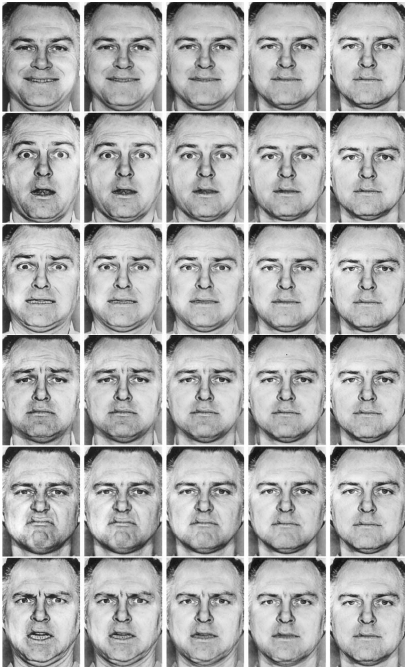
Figure S1. Example of the morphed face paradigm. Going from left to right, the columns show 90%, 70%, 50%, 30% and 10% morphs along each continuum. Fig. 4. Continua including a neutral expression used in Experiment 2. From top to bottom, the continua shown in each row are happiness–neutral (top row), surprise–neutral (second row), fear–neutral (third row), sadness–neutral (fourth row), disgust–neutral (fifth row), anger–neutral (bottom row). Reproduced with permission from Elsevier (Young et al., 1997).