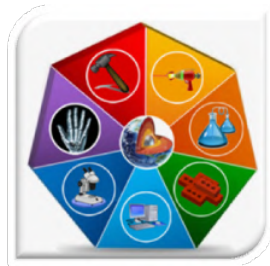
Center of Excellence "Center for Synthesis, Processing and Characterization of Materials for Application in Extreme Conditions" (CEXTREME LAB), Vinča Institute of Nuclear Sciences - National Institute of the Republic of Serbia, University of Belgrade