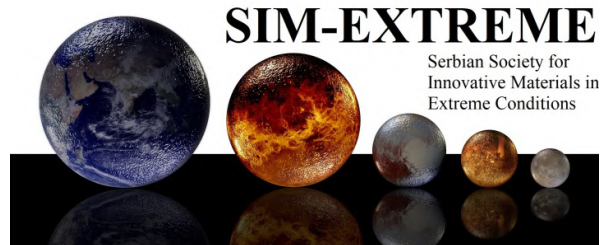
Serbian Society for Innovative Materials in Extreme Conditions (SIM-EXTREME)