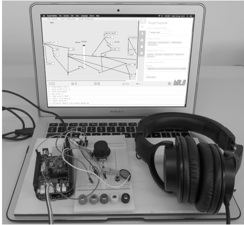
Figure 1. Each participant independently sketches simple instruments using common sensors, Bela and Pd.