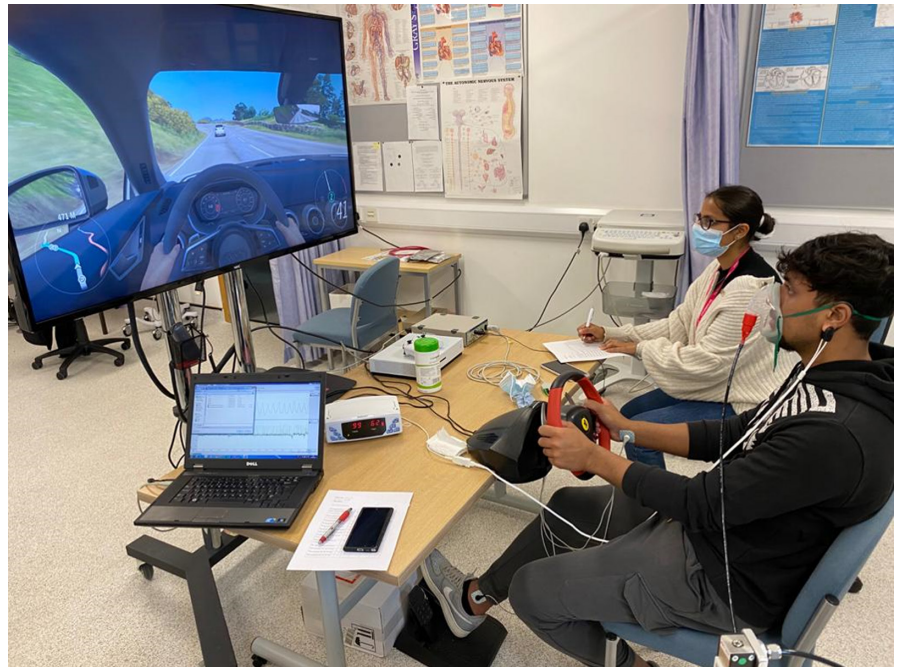
FIGURE 1 Subject participating in one of the interventions which also shows their view of the Forza Horizon 4-simulated driving software (permission taken from the subject).

Subjects were instructed to drive safely by following The Highway Code (The Department of Transport, 2022). If they were not familiar with The Highway Code, subjects were instructed to drive safely. Subjects were given verbal prompts in the practice session if they were not following The Highway Code. The software has a built-in satnav, which all subjects used, and a speedometer was clearly visible to all subjects. The route was similar for all interventions. The software also provided rear-view and left-side mirrors. All simulated driving sessions were recorded on the hard drive of the game console. Experiments were conducted in a laboratory with the lights turned off and minimal distractions.