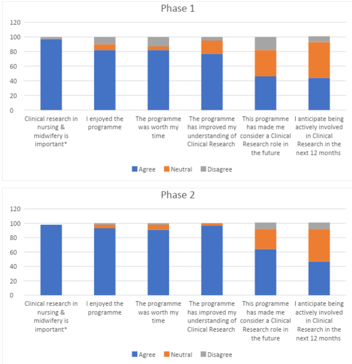
Figure 1: Phase 1 and 2 survey responses

*data from one responder is missing for this question in phase 2 as n=57