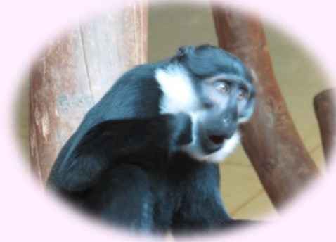
Kanye Lowest Ranking Male 11/6/2016