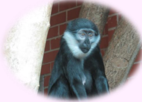
Masindi Highest Ranking Female 26/6/2011