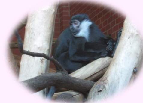
Kano Mid-Ranking Male 13/3/2018