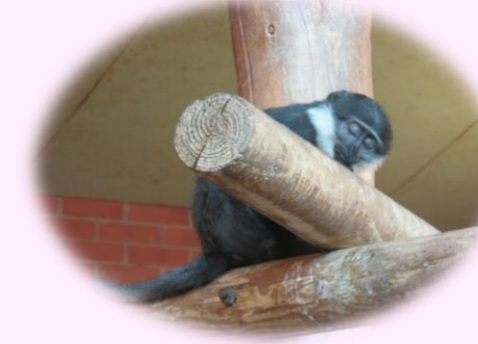
Tumba Mid-Ranking Female 20/4/2020