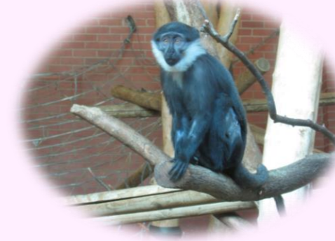
Bikonzi Mid-Ranking Female 25/9/2019