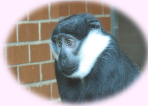
Gimini Dominant Male 12/11/2006