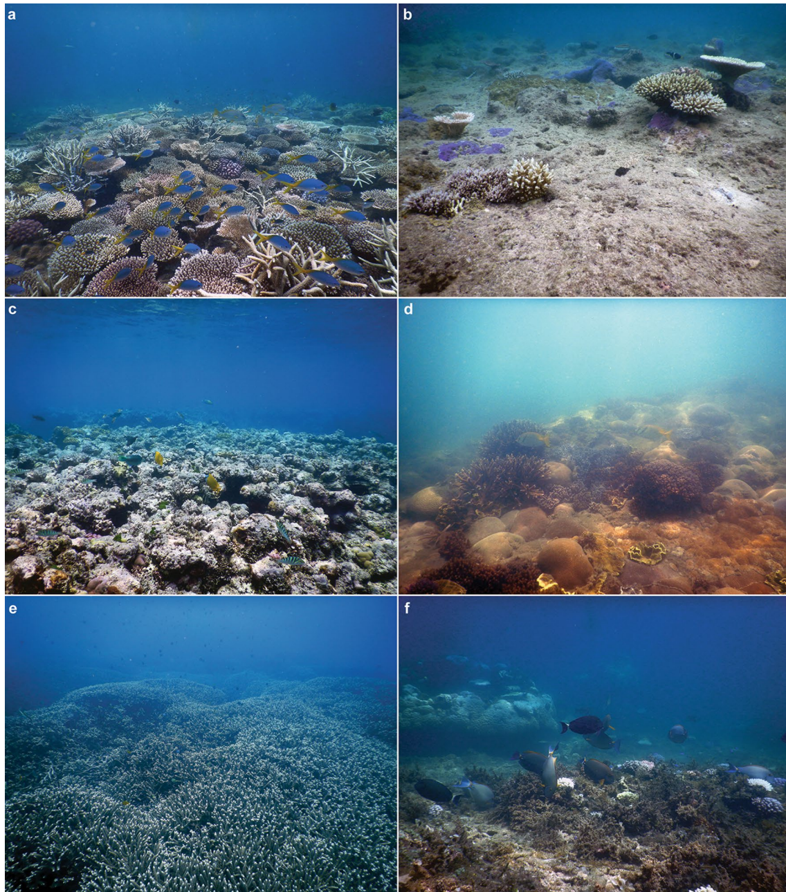
Fig. 1 ‘Coral reefs’ come in a variety of forms, all of which are embedded within their own environmental context. a Tropical, high coral cover reef system (Linnett Reef, Great Barrier Reef [GBR], 2021), b low coral cover, high turf cover reef system (Lizard Island, GBR, 2021 post disturbance by cyclones and bleaching events), c high-energy, high crustose coralline algae cover reef system (Yonge

Reef, GBR, 2021), d turbid, nearshore reef system (Bowen, GBR, 2019), e low diversity, subtropical reef system (Flinders Reef, South East Queensland, Australia, 2020), and f high macroalgal cover, low coral cover reef system (Turtle Group, GBR, 2021)