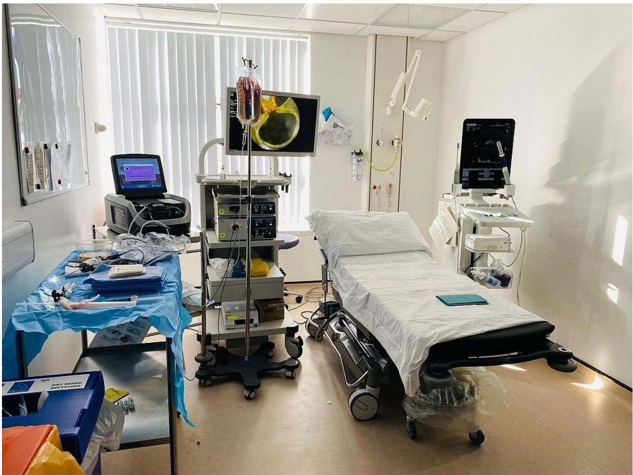
Fig. 1 Room setup with ultrasound machine to the right of the couch, and cystoscopy stack, IV drip stand, Rezūm™ machine and scrub trolley to the left