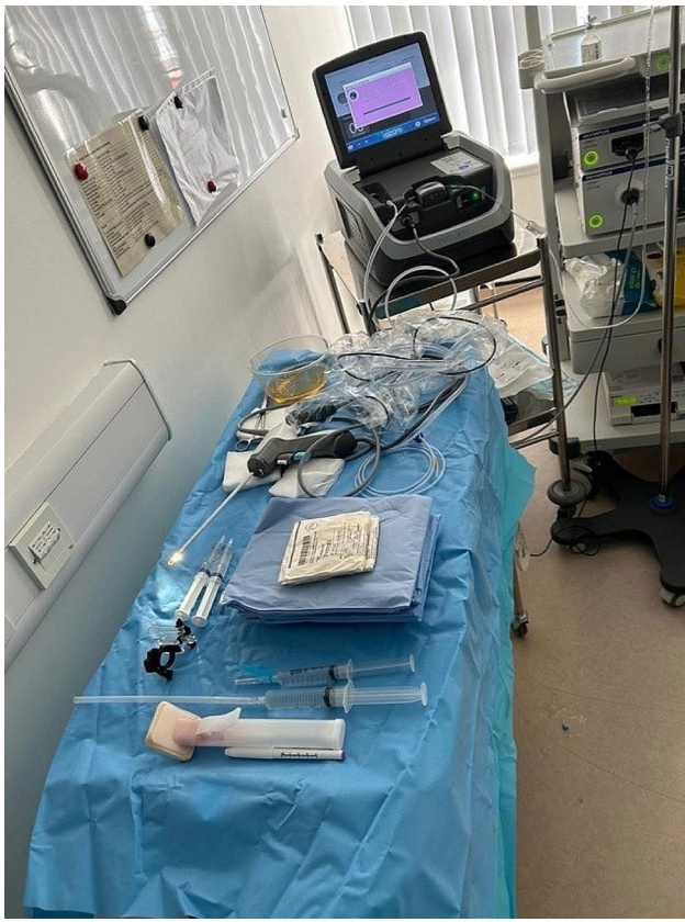
Fig. 2 Scrub trolley equipment setup