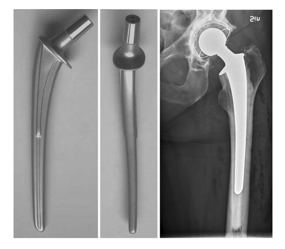
Fig. 1 Orthogonal views of the Lubinus SP II stem, demonstrating anatomical geometry in both planes. Example of cemented stem also provided

(117°, 126° and 135°). The stem collar acts to minimises subsidence [11], while the anatomic shape encourages neutral positioning in the canal, helping provide rotational stability [12]. The anatomic shape also allows for a more even cement mantle thickness to be achieved and lower rates of cement mantle fracture have been found to occur compared to in straight PTS femoral stems [13, 14]. Ultimately, this reduces the risk of cement mantle deficiency developing, which can lead to osteolysis and potential periprosthetic fracture [13, 15–17]. Recently ten times lower rates of Vancouver type B fractures have been observed to occur in the Lubinus SP II as compared to the Exeter stem in the SHAR [18].