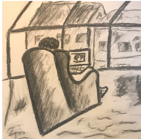
Fig. 2. Our research and work has changed during the past year, now we often work from hybrid home/work environments (K. Spiel).

as sketching, design thinking and visualisation into our computer science education is of benefit to our students and continuing learners. By collaborating on an example education curricula for sketching in HCI, we aim to create a shareable body of knowledge in this domain, to be distributed online to those working in our field.