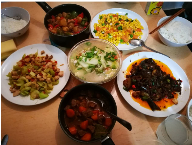
Figure 2: “Tasty food” from Wendy (F-Bus-1)

As seen in Figure 2, Wendy missed the food from home, but, more importantly, the atmosphere of home, where Chinese friends could “cook altogether” rather than “with yourself”. Co-national social connections could be helpful to ease feelings of loneliness and homesickness (Cai et al., 2019), but Chinese students in this study felt lonely and homesick again shortly after spending time with fellow Chinese students. Therefore, Chinese PGT students in this research explored a variety of coping strategies, such as contacting family and friends in China or developing new hobbies.