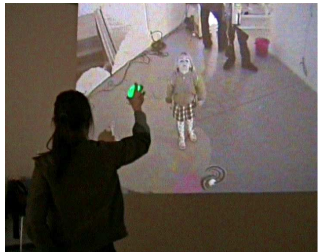
Illustration 1. Two children playing with the installation.

The ball in the hole is a social installation/performance where the user becomes the actor of metamorphosis. The discovering of the self and the legendary mirror to other dimensions is experienced through a real-time tactile digital environment.