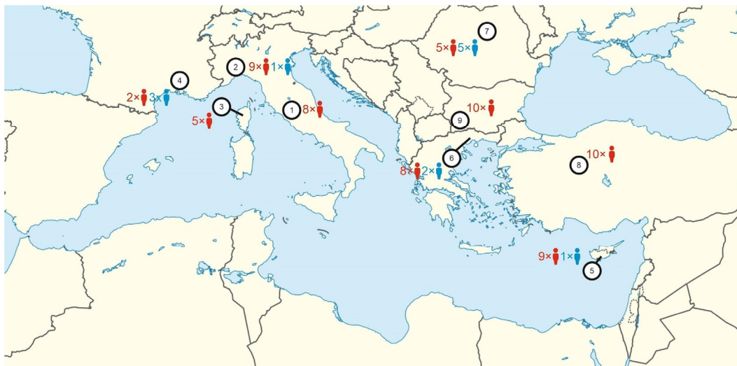
Figure 2. Localization of the focus group discussions and their geographic collocation (cartography based on Wikimap). 1, Italy: Alessandria Province; 2, Italy: Greccio, Acilia, and Genziano; 3, France: Corsica; 4, France: Provence; 5, Cyprus: Nicosia, Limassol, Protaras, and Pafos; 6, Greece: East Macedonia and Thracia; 7, Romania: Harghita County; 8, Turkey: Eskisehir and Central Anatolian Region; 9, Bulgaria: Southwest Bulgaria. For each location, it indicated the category of the participants (red: professionals in the sector, blue: stakeholders). For a detailed list of the participants, see Appendix A.

Overall, the research involved 14 focus group discussions, with each partner organising and conducting 2 focus group discussions under the supervision of the University of Gastronomic Sciences researcher (Figure 2). The discussions were moderated by researchers trained for this purpose according to a shared methodology [48]. All the discussions were conducted between June and September 2022. None of the discussions extended over 2 h, and all were developed around four questions: