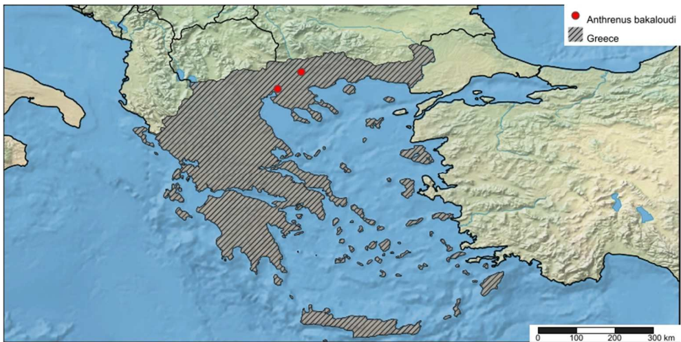
Fig. 3. Locations of collections of Anthrenus bakaloudisi from Greece.

Abundance and distribution. In the field, A. bakaloudisi is most likely to be confused with A. delicatus . Eighty nine A. delicatus all collected from within 40 km of Thessaloniki, Greece were examined, eight of which were A. bakaloudisi . Anthrenus delicatus were also examined from Croatia, Albania, Cyprus, Turkey, Syria, Jordan, Iran, Israel, Azerbaijan, Turkmenistan. No A. bakaloudisi were found beyond Greece. The sites of collection of A. bakaloudisi are shown in Figure 3.