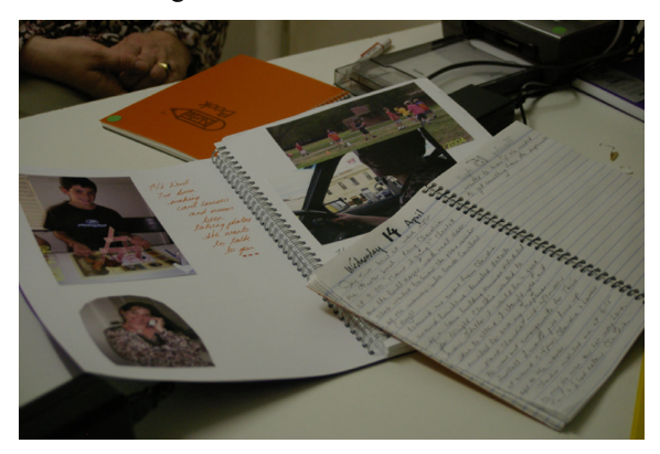
Figure 2: Scrapbook and diary from participants