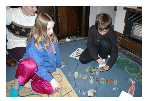
Figure 4: Participant's children playing with facsimiles