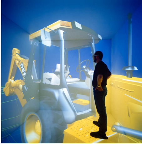
Figure 1. The six-sided cave.