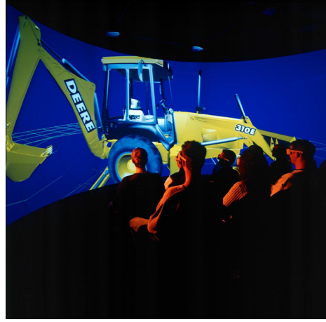
Figure 2. The panoramic display.

For interaction we used Polhemus Fastrak motion tracking, an Sgi Spacemouse (3D mouse), a “magic wand” (3D joystick) and a wireless trackball from Logitech with tracking via the Polhemus system. In the cave we additionally did motion tracking using a computervision system developed during the project. A 6-pipe Sgi Onyx2 Reality Engine graphics computer with 16 CPU’s and 2 GB ram powered the virtual reality installations. All interaction devices except the computervision system were plugged directly into the Onyx2. The computervision system ran on a dedicated Windows NT dual processor machine handling video input from 4 cameras, communicating with the graphics computer via TCP/IP.