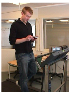
Figure 1. Test subject walking on a treadmill in the usability laboratory

We conducted a series of usability tests employing each of the six techniques above. In each test, the user solved a number of specified tasks using a mobile system. The first five techniques were employed in a usability laboratory. The sixth technique was employed in the field.