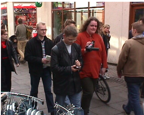
Figure 4. Usability test session in the pedestrian street

We designed the pedestrian technique to include systematic data collection. All tests in the pedestrian street were video recorded using a video camcorder as shown in figure 4 below.