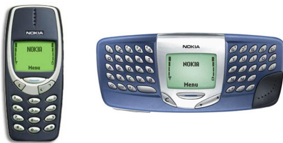
Figure 2. The Nokia 3310 and 5510

We conducted a series of usability tests employing each of the two techniques above to test the usability of two different mobile phones. In each test, the user solved a number of tasks using one of the two mobile phones.