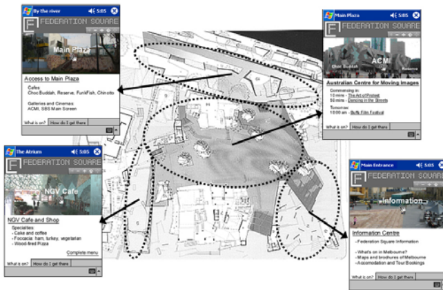
Figure 2. Four location districts and corresponding screens.

The information pushed to the mobile device is tailored to information needs within a specific district. When a user moves into a new district, their context changes, and so does the information that appears on the screen of their mobile device. As the user enters a district, an interactive photorealistic depiction augmented with textual and symbolic information pertinent to that district is pushed to their device. To allow the user to align the information on their display to their physical surroundings, the initial screen displays the corresponding landmark for that district. From this starting point, the user can alter the current perspective and select linked information.