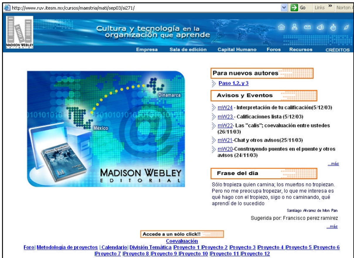
Figure 2 Madison’s home page.

Briefly, the first menu item “Empresa” (Enterprise) includes the organization’s mission, values and main editorial policies. Here the students learn that Madison produces all sorts of digital products such as books, tutorials, online courses, web sites and so on, and that products are developed by teams of authors distributed over Cyberspace. These products are divided into several Thematic Divisions, and authors are to produce works related to the Organizational Learning (OL) Division. In this same menu item they also find submenu “product catalog” which links towards digital products previously published by Madison (in previous versions of the course), submenu “current projects” which links to current project portals and another submenu linking to a description of the project methodology used to develop digital products. Menu item “Human capital” points to Author profiles, student’s individual reflection logs or web-log’s (from here on called ‘blogs’) and a document with author and editor role descriptions. “Resources” links to Madison’s library, editing help files and so on. Finally “Forums” leads to several asynchronous dialog forums.